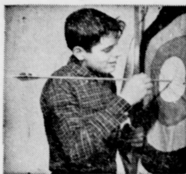
Young people need help in