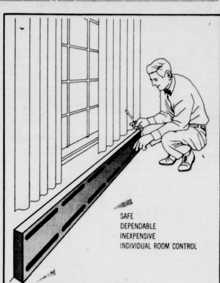
SAFE DEPENDABLE INEXPENSIVE INDIVIDUAL ROOM CONTROL

CHRISTIAN SCIENCE RADIO SERIES SAN ANGELO KGKL 960 on Your Radio Dial