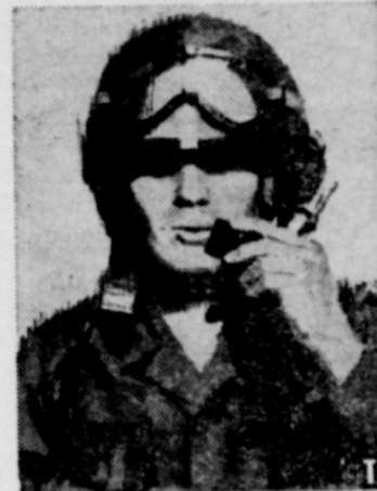
The U.S. Army Reserve.