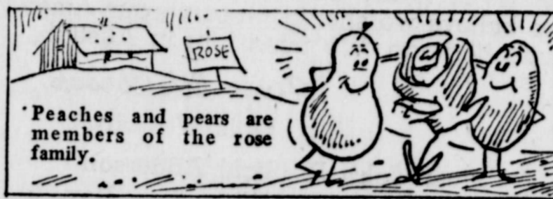
'Peaches and pears are members of the rose family.'

Now's the time to call your Heating serviceman.