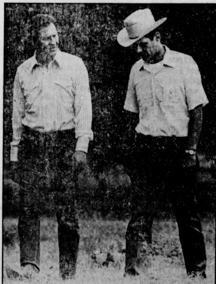
The kind of man we need in Washington.

A statesman, not just another politician.