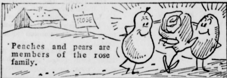
Peaches and pears are members of the rose family.