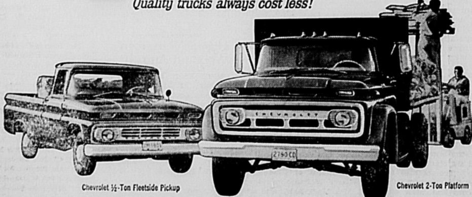
Chevrolet 1/2-Ton Fleetside Pickup