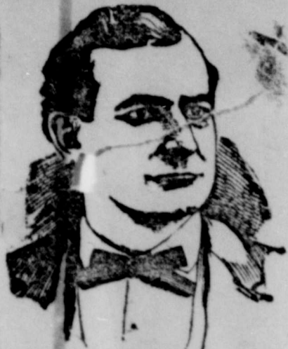
WILLIAM JENNINGS BRYAN President 1900.

The Democratic gain in Texas in this campaign is very gratifying to the democratic leaders.