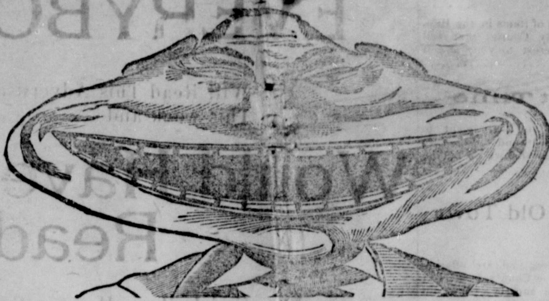
"Boys, I got there, but I tell you, they wearied me."