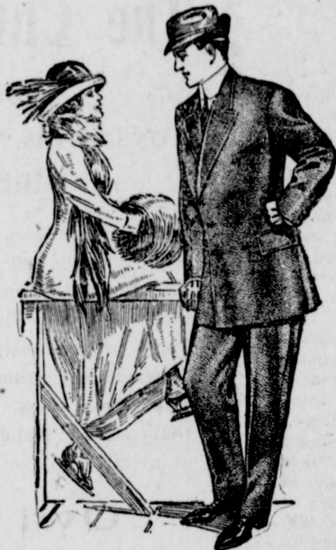
Three-Button Double-Breasted Sack, No. 749

If you want to make brother, father, sweetheart, son, relative or friend happy and proud of his present and see him dressed to suit you, select one of our handsome woolens and