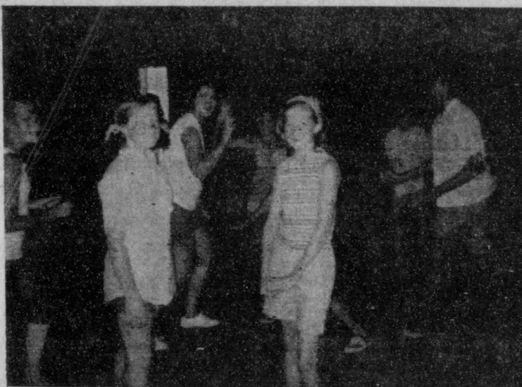
The above pictures show activities at Rotan's Summer Recreation program. The project is proving popular with both boys and girls. Attendance has been averaging in the 50's each day, and program will end July 18.