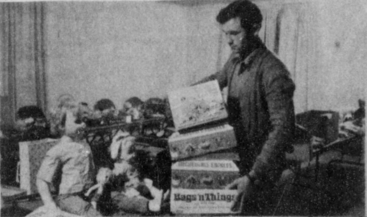
Assembling Toys Dec 21st