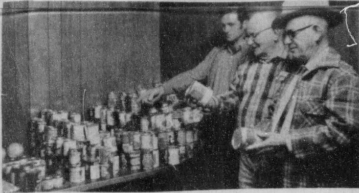
Collecting Can Goods Dec. 17th