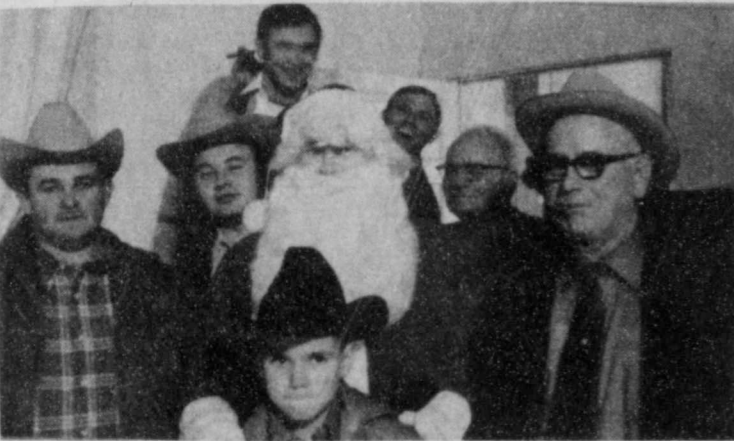
Santa And Crew Dec. 24th