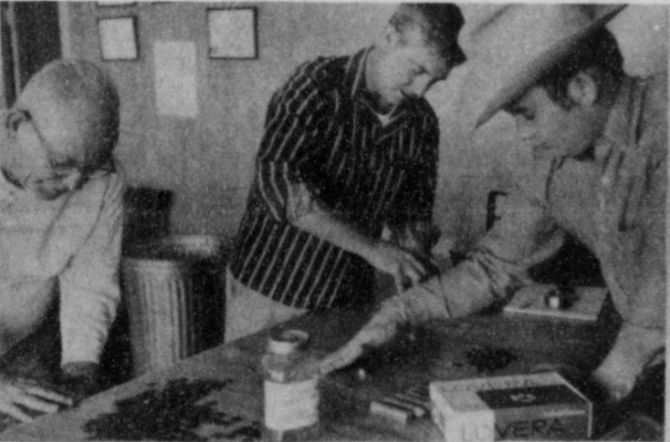
Counting Collections Dec. 26th