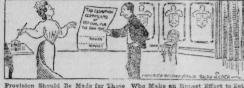
Provision Should Be Made for Those Who Make an Honest Effort to Better Their Condition.