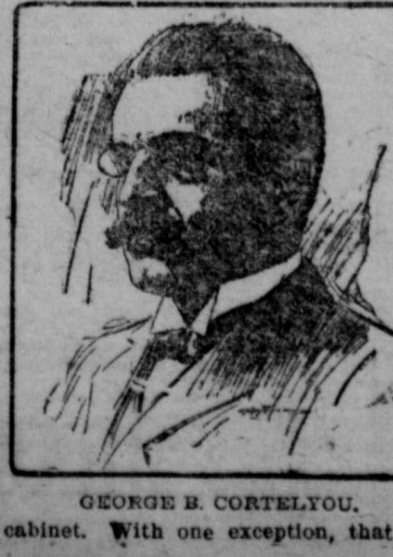
GEORGE B. CORTELYOU, cabinet. With one exception, that of

Fairbanks a Methodist. Washington, March 6.—Vice President and Mrs. Fairbanks attended service Sunday at their usual place of worship, the Metropolitan Methodist Episcopal church.