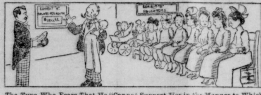
The Type Who Feels That He "Cannot Support Her in the Manner to Which She Is Accustomed" Should Be Turned Over to the Father of a Large Family of Girls.

Washington, March 6.—Commissioner James R. Garfield, of the bureau of corporations, has instituted a rigid investigation of the operations of the oil industry in Kansas and cognate states.