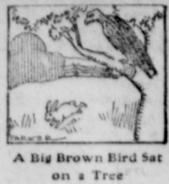
A Big Brown Bird Sat on a Tree

"TONIGHT," said daddy, "I'll tell you a story about little Bobby Cottontail." "Who is Bobby Cottontail?" asked Jack and Evelyn. "Bobby Cottontail was a little rabbit. He lived in a burrow, a sort of tunnel dug as a home for her little ones by Mother Rabbit. There were five young rabbits in this burrow besides Bobby.