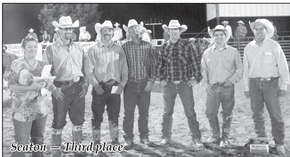
Seaton — Third place