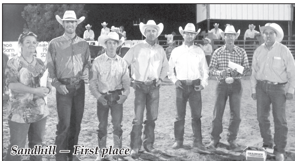
Sandhill — First place