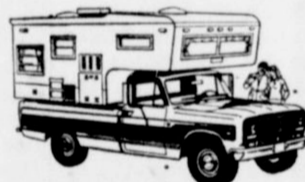
INTERNATIONAL CAMPER SPECIAL