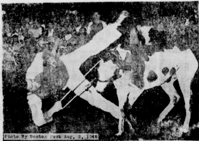
Aug. 2, 1948