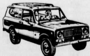
SCOUT by International