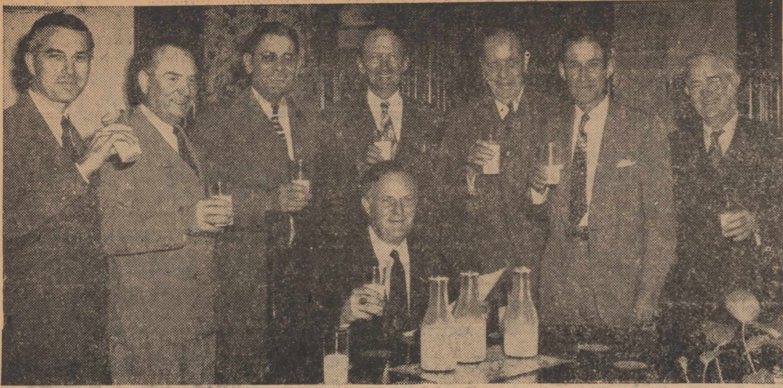
DAIRY FARMERS SALUTED —June is dairy month in Texas by official proclamation of Gov. Beauford H. Jester. The proclamation is a tribute to 338,000 dairy farmers in Texas who own 1,400,000 milch cows, valued at $150,000,000 and which produced four and one-half billion pounds of milk in 1946 with a net value of $100,000,000. During the past 20 years Texas has advanced from twentieth to eighth place in value of dairy products.