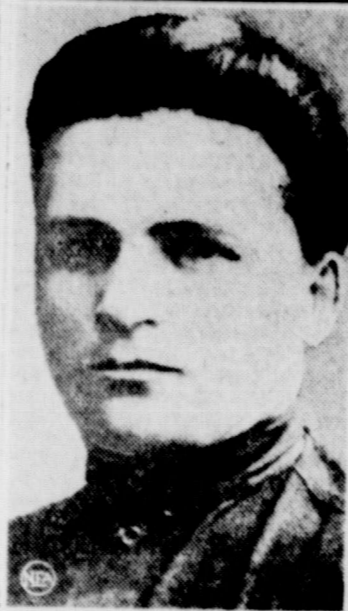
Slain in Leningrad by "an enemy of the working class." Sergei Mironovich Kiroff (above) member of the political bureau of the Communist party which rules Soviet Russia, became the first important victim of political assassination in the U. S. S. R. since 1918.