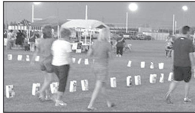
Relay started at the Littlefield High School practice field and then moved indoors.

keep us from raising $41,000 for an amazing organization," she added.