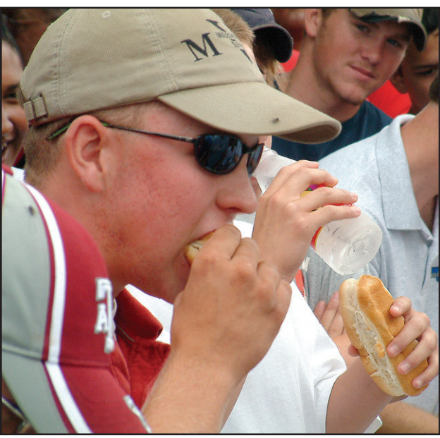
An unidentified participant chows down on his hot dogs in the 2006 contest.

Volume 93, No. 26 www.muleshoejournal.com Muleshoe, Texas June 28, 2012