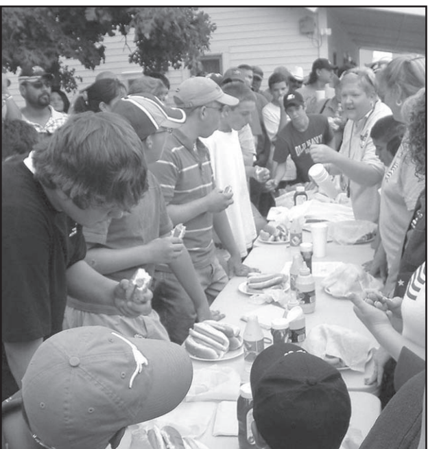
2006 Hot Dog Eating Contest