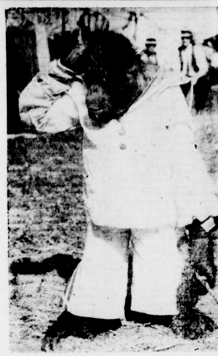
This my friends, is Joe the famous movie orangutang and one of the 800 furred and featured who will arrive in Cisco Monday, October 18th, with the Al G. Barnes and Sells Floto Combined Circus. Joe is all dressed up, but hasn't a place to go hence the look of bewilderment and head scratching. Two performances will be given, at 2:00 and 8:00 p. m.