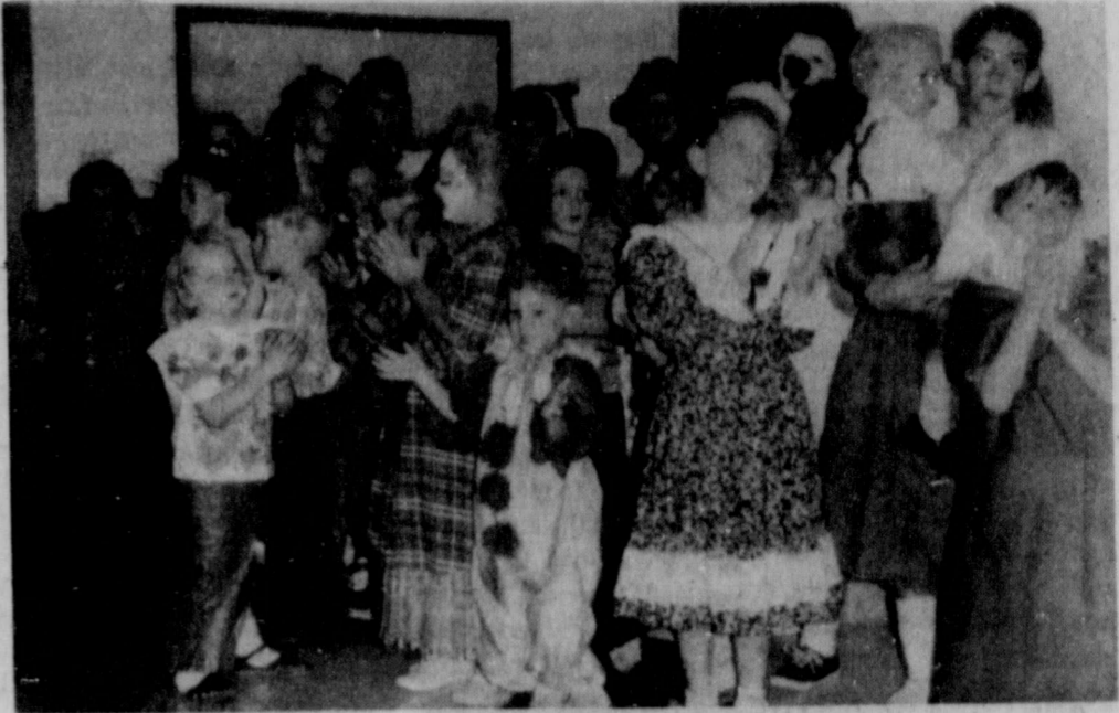
The New Life Childrens' Church