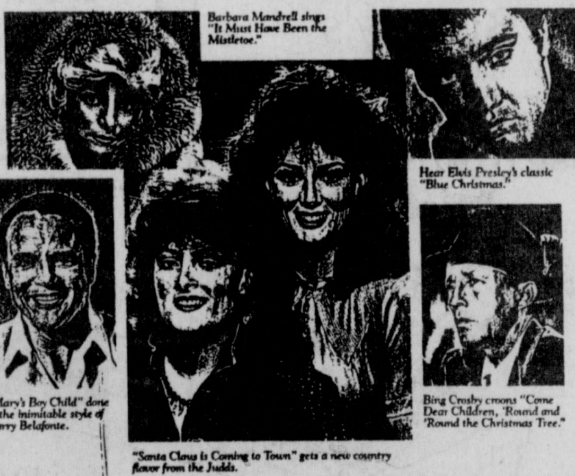
"Merry, Merry Child" done in the inimitable style of Harry Belafonte.

duplication (DAAD) process for improved sound quality. So, drive into your nearest participating Exxon station for quality gasoline, pick up some of the best songs of the holidays and start the season in great spirit.