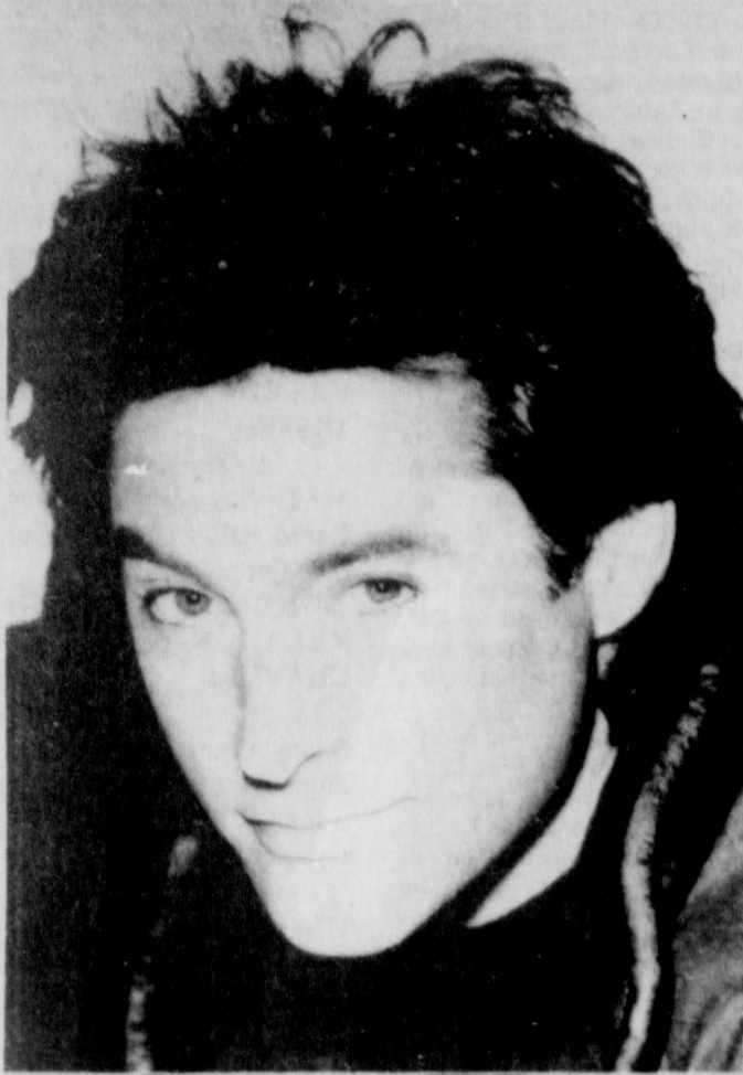
Drake Hogestyn (Roman Brady)

One weekend each year, motorsports fans from throughout Texas are attracted to Abilene for "The Greatest Show On Wheels" combining an elaborate display and judged competition with non-stop entertainment for all ages and every member of the family.