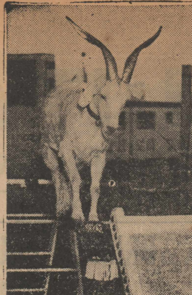
This goat with gilded horns and nonchalant ways walks a slack rope nightly at the Texas Centennial Exposition in Dallas as part of the five acts of big-time vaudeville presented free.