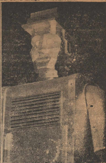
This mechanical man, one of three at the Texas Centennial Exposition in Dallas, blinks his eyes, lowers his jaws and discourses on the history of labor in the Federal Exhibit Hall.