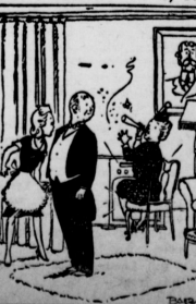
"Elsa Maxwell certainly gets Madame into the spirit of things."

three inches of rain in the first seven months. Someone reported to this writer that the total in 1918 here was only 6 inches or so and from the way we have started out we