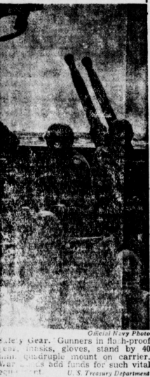
Soldiers gear. Gunners in flat-hooded coats, helmets, gloves, stand by 40 mm quadruple mount on carrier. War bonds add funds for such vital equipment. U. S. Treasury Department.