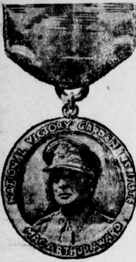
General MacArthur Medal

Information may be had from local and state Victory Garden chairmen or committees, or from National Victory Garden Institute, 509 Madison Avenue, New York 17, N. Y.