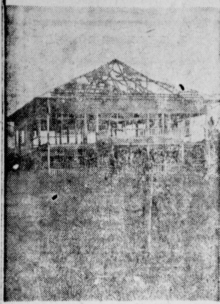
Mindanao Ruins. U. S. 47th Div. infantrymen advance on house that was shattered by shells. War Bonds helped to supply. Action at Zamboanga, Mindanao.