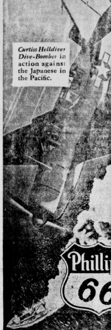
Curtis Heldiver Dive-Bomber in action against the Japanese in the Pacific.