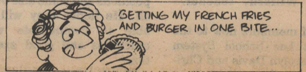
GETTING MY FRENCH FRIES AND BURGER IN ONE BITE... A tasty way to extend hamburger meat is to add one grated raw potato per pound of meat.