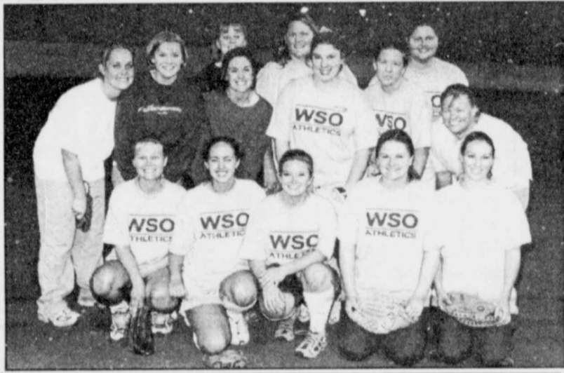
Women's softball winners WSO