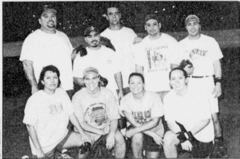
Co-Rec softball winners Bust 'N Balls

WSO scored five runs in the first inning on its way to a 7-1 victory over Wonder Women. This marked the first All-University Championship in any sport for WSO.