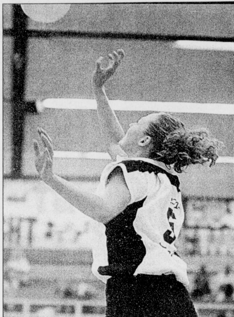
The Red Raider volleyball squad will take on the Aggies at 7 p.m. today in College Station.

"She's a tough kid, and she will be see VOLLEYBALL, p. 7