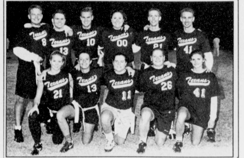
Co-Rec Football champions the Texans

In the Raider Championship, the Short Bus Riders defeated the Cougars 26-14 to win their first title.