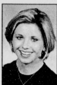
Amy Curry Staff Writer

and Dykes' coaching ability were back in the stands and more faithful than ever.