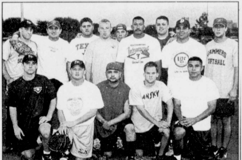
Men's softball winners More Than Trouble