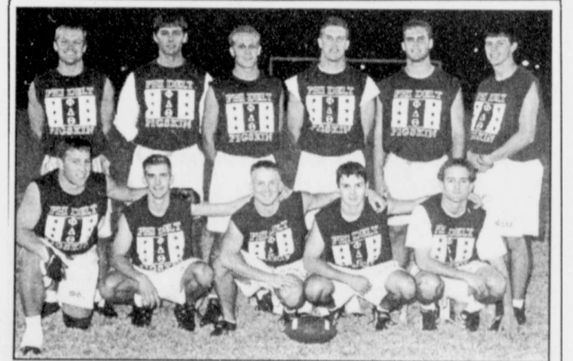
Men's football winners Phi Delta Theta