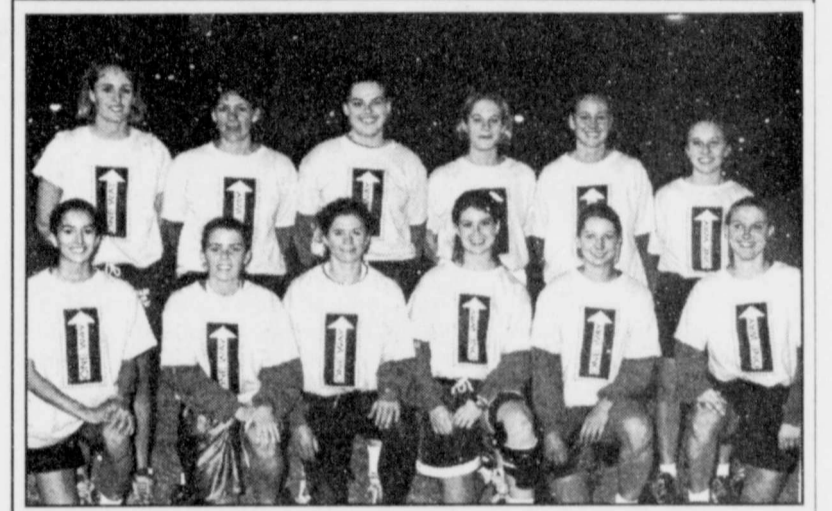
Women's football winners One-Way