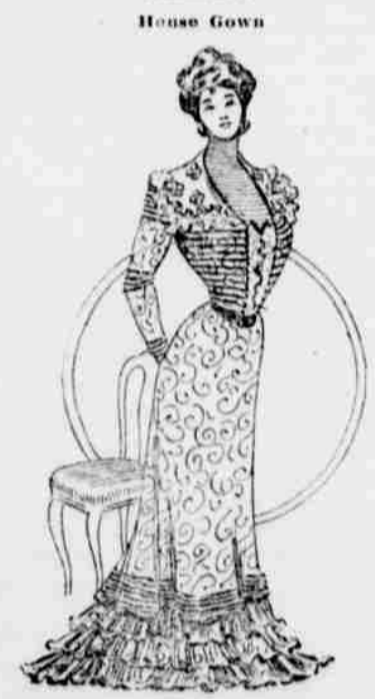
Of figured blue India silk, tucked yoke of corn color panne velvet; deep collar of white satin embroidered in blue.

House Gown. The average woman will pay great attention to the curves in her figure and the style of the neckbands she must wear, and the way to arrange her hair, and the fit of her gloves; but she will dose her face with cold water and bad soap, use powder carelessly, and then wonder why her skin is not lovely.