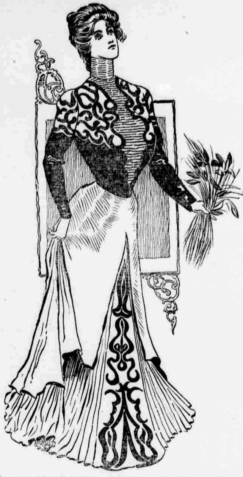
For young girl, of blue silk, trimmed with a darker shade and ribbon applique. Vest of tucked yellow silk.

House Gown. The average woman will pay great attention to the curves in her figure and the style of the neckbands she must wear, and the way to arrange her hair, and the fit of her gloves; but she will dose her face with cold water and bad soap, use powder carelessly, and then wonder why her skin is not lovely.