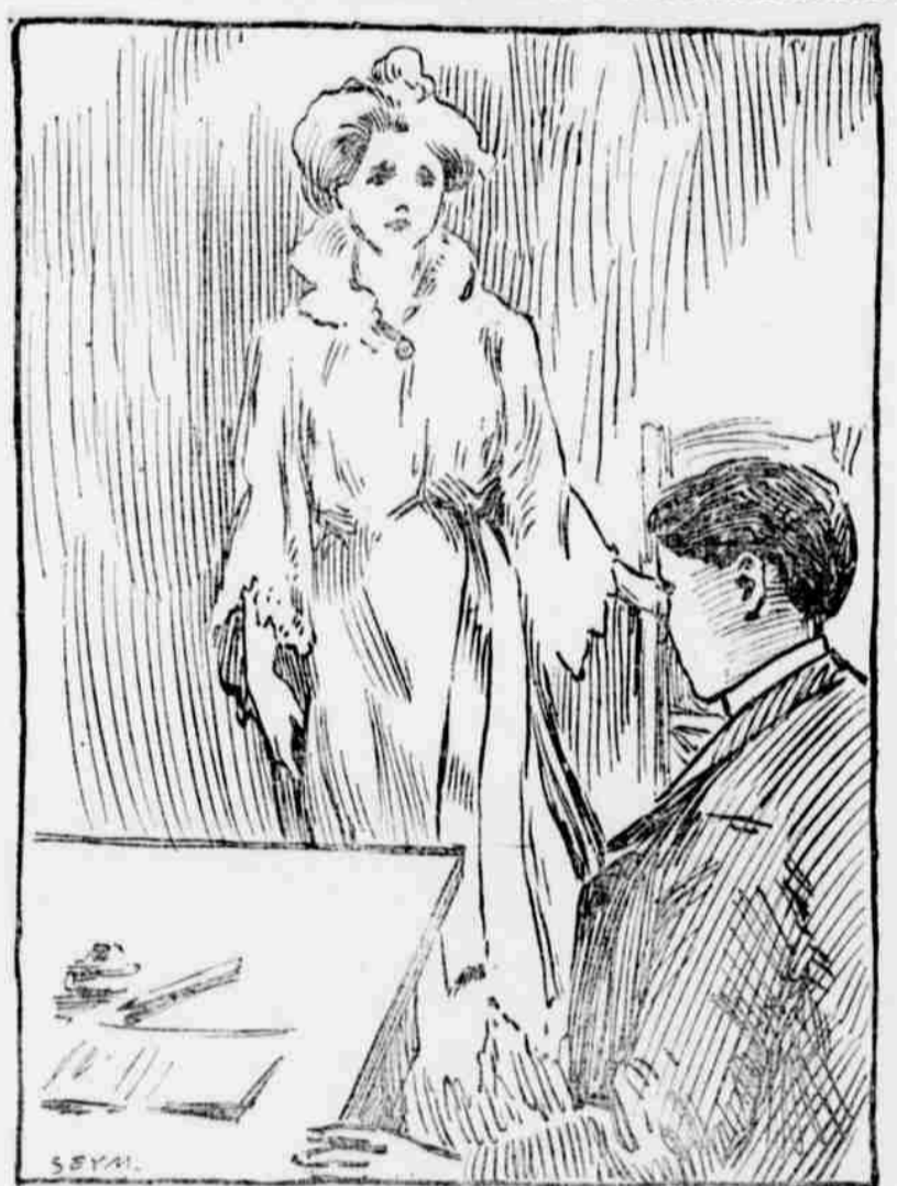
TAKE THIS DICTATION FROM ME.