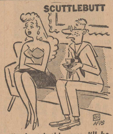
"Look at it this way-I'll be at sea most of the time!"

All persons interested in trying out for the Reese AFB Swimming and diving team are asked to sign up at the Personnel Services office. The Southwest Conference swimming and diving tournament is being held July 8-11 at Sheppard