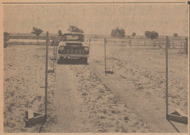
VEHICLE ROADEO-A/IC Gene Latham, Motor Vehicle squadron, comes through the diminishing clearance with a perfect score in the preliminary runoff of the motor vehicle roadeo. The path narrows to a six-inch clearance at the final stake.