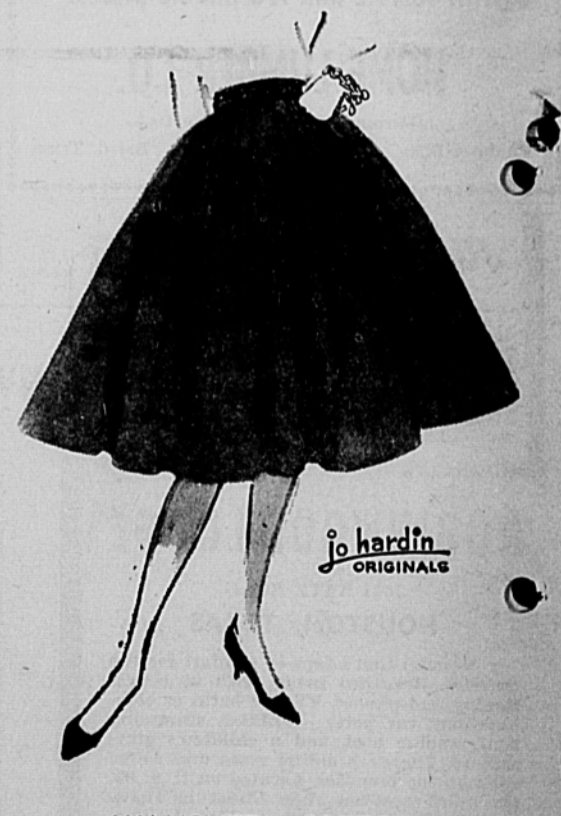
jo hardin ORIGINALS

WAMSUTTA COTTON COLORS — Green, Brown, Purple