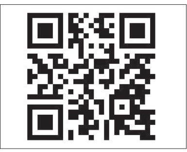
Find us online at: www.bigspringherald.com