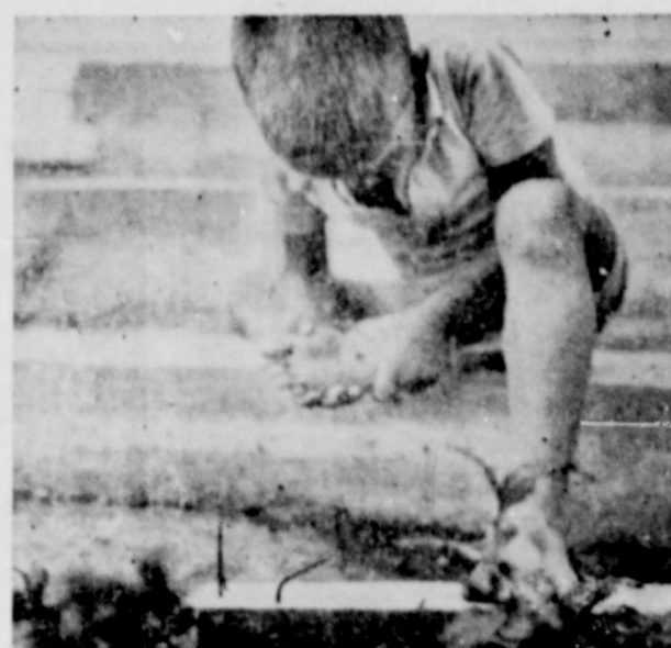
Puncture wounds are a common cause of tetanus.

Once on the ground the spores, which are unaffected by