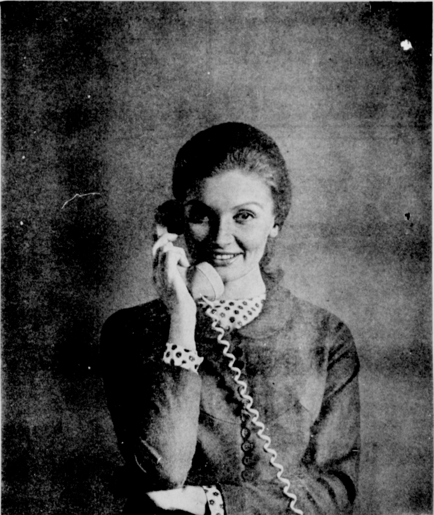
Our customer's representative is a good listener

Order by mail or telephone—we guarantee satisfaction and to fill your order correctly. Turn In Your Order at The Office of This Newspaper