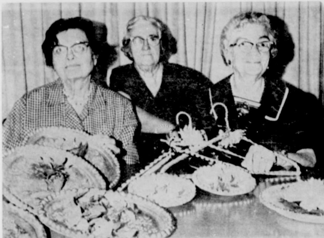
DISPLAY CRAFTS - - These three residents of Hillcrest Haven are shown with their handicrafts which they made. Using their time to be creative brightens their day and the days of those who receive the gifts.