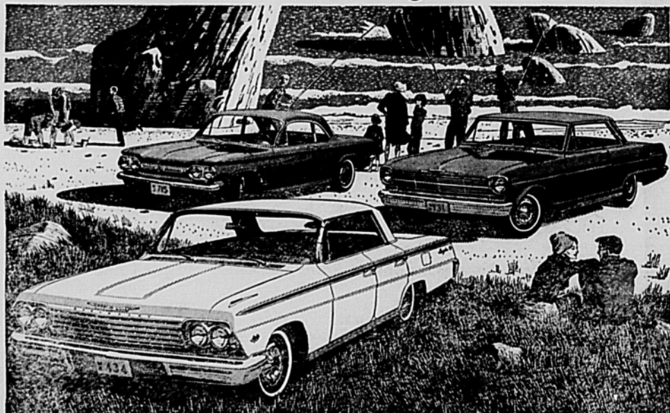
CHEVROLET IMPALA Room, refinement and riding comfort. Foreground, the Impala Sport Sedan.