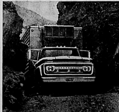
Users of new conventional medium- and heavy-duty units who have to operate in close quarters are going to like the narrower front ends (up to 7 inches).

New engines, suspensions, frames and narrower front ends show their stuff on Mexico's tough Baja Run!