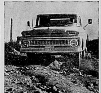
Conventional light-duty units have coil-spring independent front suspension—easier on truck, load and driver.