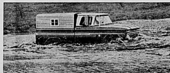
When we came to a river we got wet. This river bed was paved with rocks the size of melons. What a test for new light- and heavy-duty suspension systems this was!