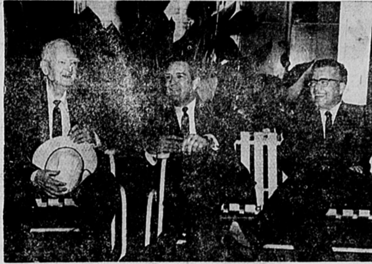
DEMOCRATS, ALL — Three of Texas' most enthusiastic Democrats — former Vice President John Nance Garner, John Connally, Democratic nominee for governor, and Dolph Briscoe, former president of the Southwest Cattleman's Association, left to right — expressed confidence of a sweeping Democratic victory in November. Mr. Garner, who served two terms as Vice President of the United States, gave his unqualified support to Connally. He said he was supporting Connally because "he's best qualified," and announced he was going to vote the Democratic ticket "straight" on November 6.

1st National auto loans at low bank rates. Insure where you please. 1st National in Baird, Mbr. FDIC