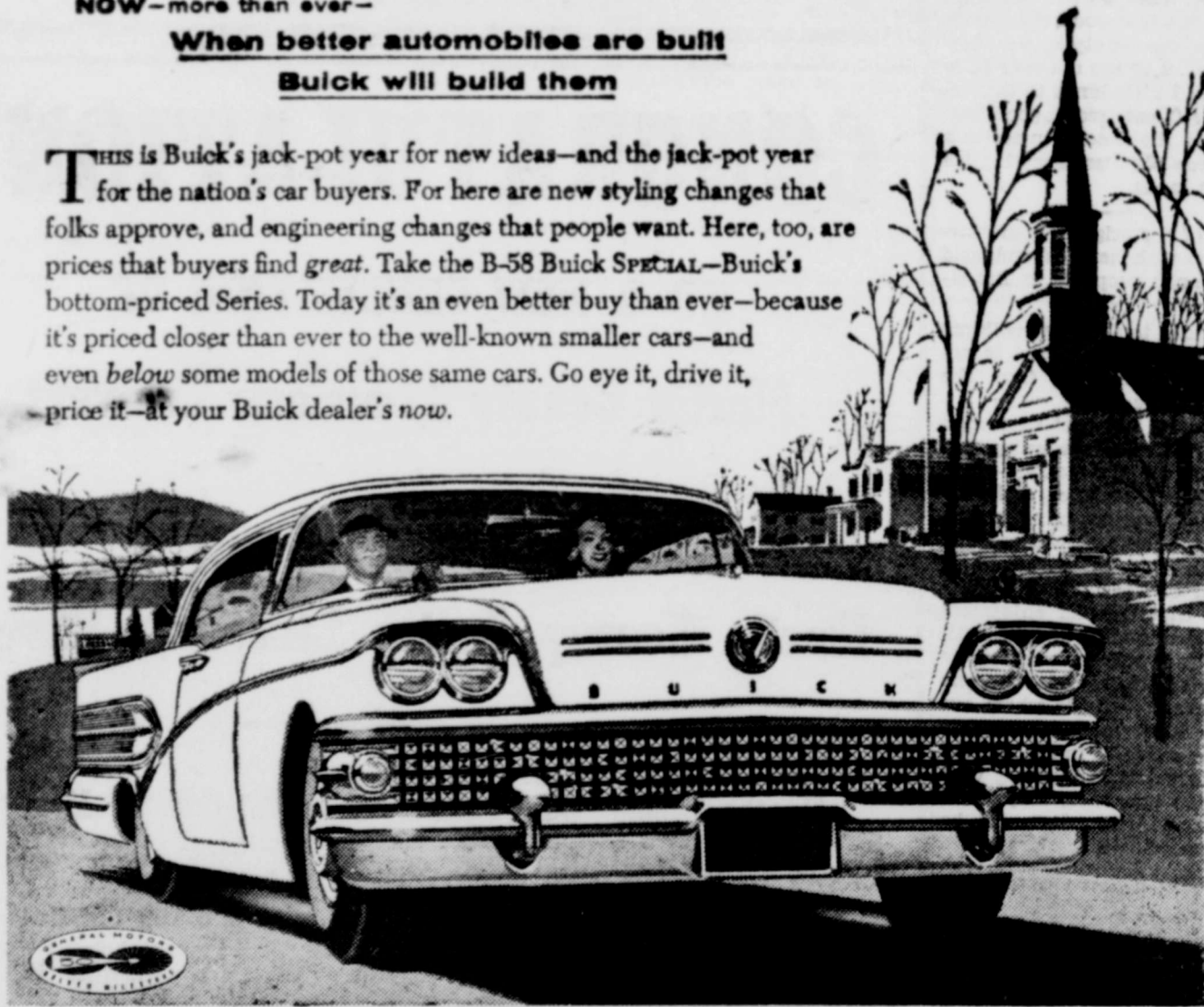
THE B-58 BUICK SPECIAL RIVIERA—the big car that's light on its feet—but priced right down with the smaller cars

This is Buick's jack-pot year for new ideas—and the jack-pot year for the nation's car buyers. For here are new styling changes that folks approve, and engineering changes that people want. Here, too, are prices that buyers find great. Take the B-58 Buick SPECIAL—Buick's bottom-priced Series. Today it's an even better buy than ever—because it's priced closer than ever to the well-known smaller cars—and even below some models of those same cars. Go eye it, drive it, price it— at your Buick dealer's now.