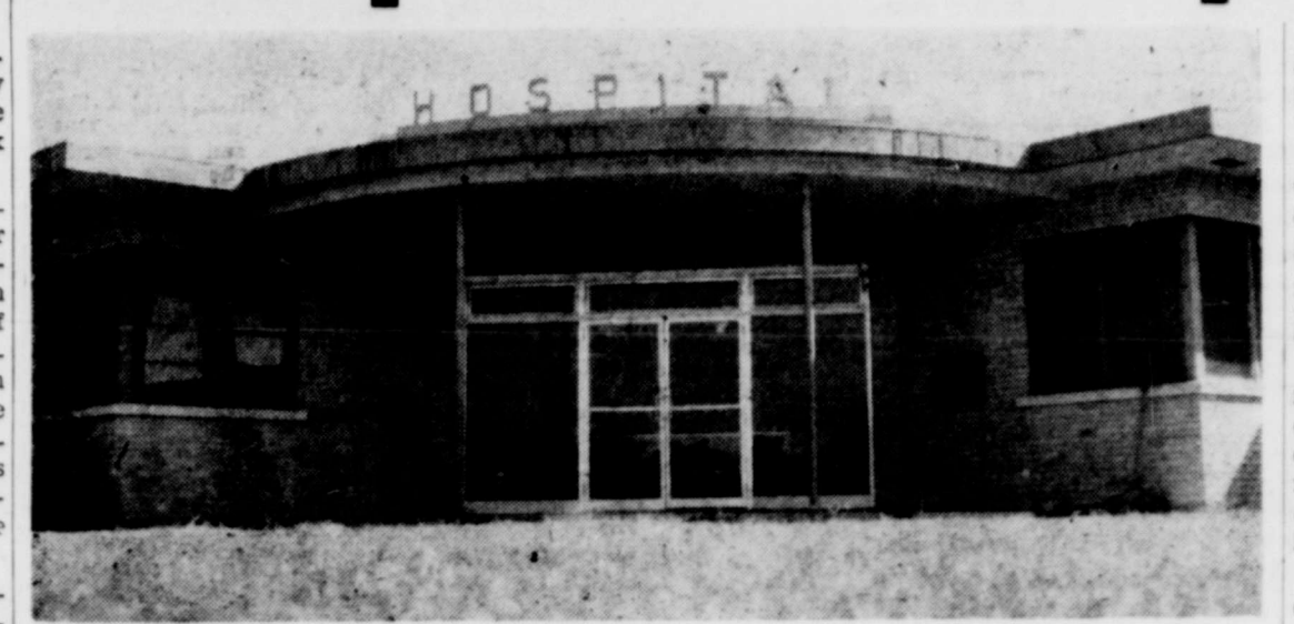
GOOD NEWS-Martin County Memorial Hospital has been reopened under lease agreement with the county by the newly formed Physicians Hospital and Clinic, Inc.

Twelve miles northeast of Stanten in East Martin County, Humble Oil & Refining Company was making hole below 10,050 McKaskle, scheduled 11,100-foot