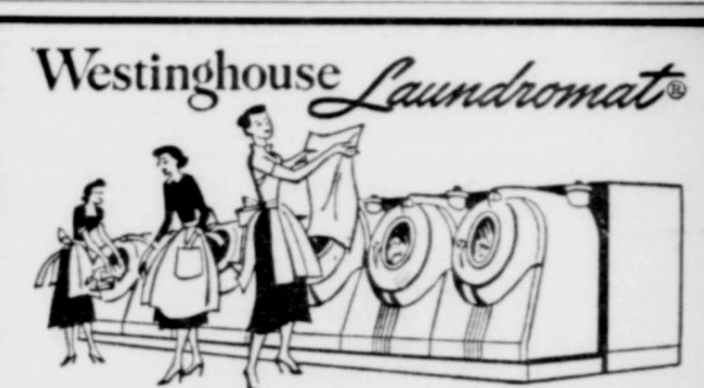
6:00 A. M. To 9:30 P. M. 7 Days A Week 103 St. Benedict Street