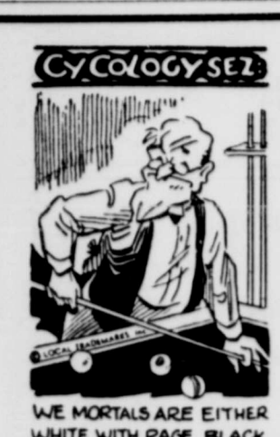
WHITE WITH RAGE, BLACK WITH DESPAIR, GREEN WITH ENVY OR ROSY WITH HAPPINESS

And we are most likely to remain happy if we carry adequate insurance with substantial old line capital stock insurance companies adhering to the rates and rules of the Texas Insurance Commission, such as are represented by