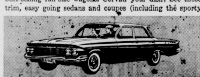
New Bel Air 4-Door Sedan—Popularly priced and packed with all the Chevy virtues.

You can't beat your Chevy dealer for a July buy! Summertime savings are in full swing. And—because those Jet-smooth Chevys are outselling all other makes—he's in a position to make the savings even better. Take your pick from luxurious Impalas, popular Bel Airs, thrifty Biscaynes and those best-selling full size wagons. Corvair your dish? See those trim, easy going sedans and coupes (including the sporty