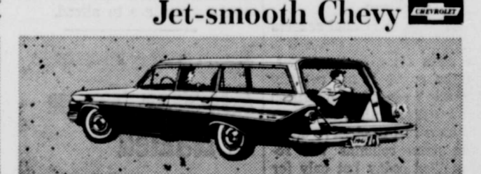
New Nomad 5-Passenger Station Wagon—Most luxurious of Chevy's six best selling wagons.

See the new Chevrolets at your local authorized Chevrolet dealer's