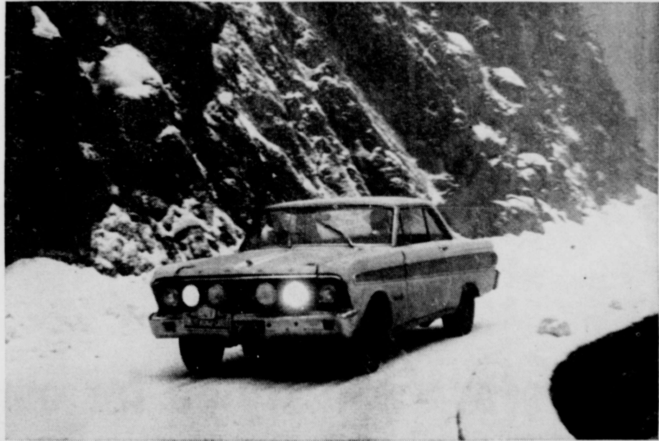
Four Falcons started from Oslo, four from Paris, on routes calculated to be equal in difficulty and length. Weather conditions varied from clear, bitter cold through freezing fog to blinding snow—and the time schedules made no provision for delays. Here a Falcon swirls through a sudden snow shower, testing traction in a practice run.

Falcon entered two classes in Europe's 2,700-mile winter ordeal-won them both and finished 2nd overall out of 299 cars. That's durability!