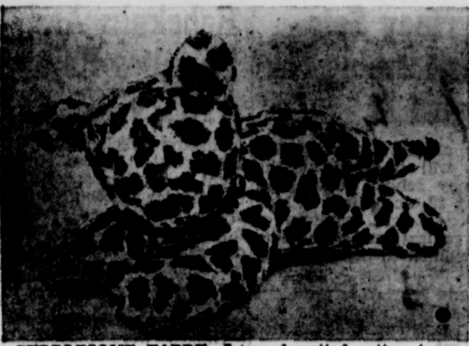
CUDDLESOME TABBY —Leopard-spotted cotton terry cloth is the magic ingredient for creating this easy-to-make toy. Brilliant green buttons are used for eyes, and a real cat collar complete with bells circles his neck. Free instructions from the Cotton Council, P. O. Box 12285, Memphis, Tennessee.

Trade With Your Hometown Merchants And Save!