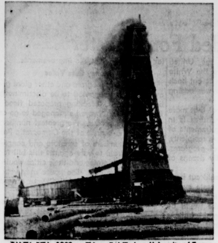
19723, from a depth of 3,028 feet, and drew after