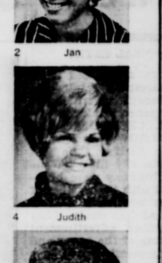
Can You Match These Mothers and Daughters?*