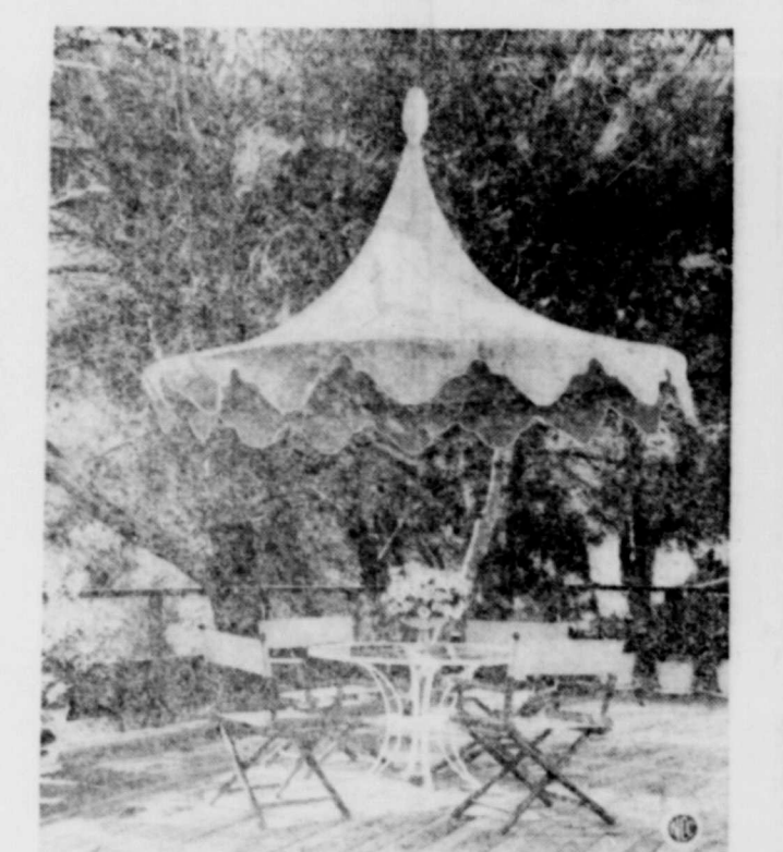
CONE OF CANVAS-Laced to circular metal tubing, this smart cotton canvas canopy hangs from a tree and creates an inviting terrace setting. The glass-topped wrought iron table is perfect for an informal party or a game of bridge. Director-type chairs are covered in cotton canvas, too.

ilee. It is Jesus blessing the money - changers from the and deeds, daring to assert