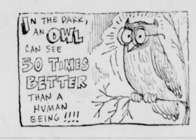
ED ROBB, Evangelist Abilene, Texas

Meanwhile, requests for te- A good fire break could easily chnical assistance on farms mean the difference in profit