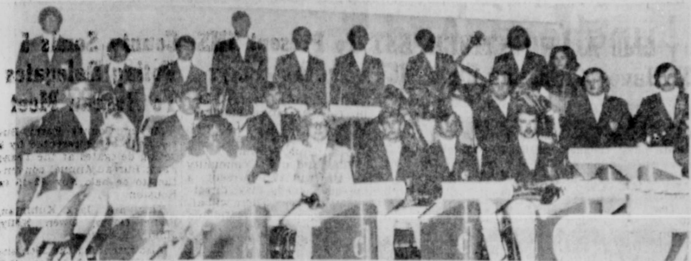
1972 CISCO JUNIOR COLLEGE BAND to appear in Stanton