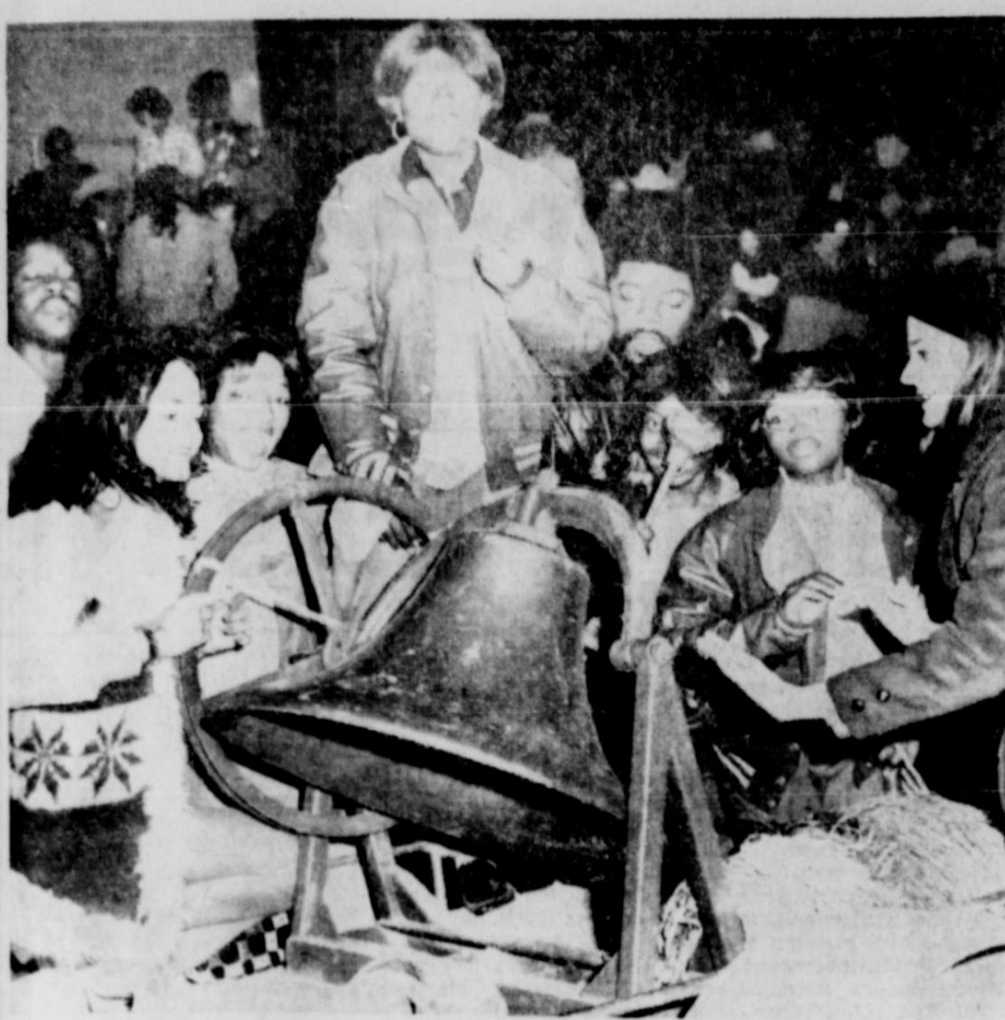
VICTORY BELL KEPT RINGING — Buffalo fans kept the bell ringing as Stanton earned a 20-12 victory over McCamey Friday night. It came unglued at one point when the bell clapper was noted being held by a Booster.