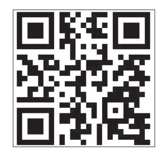
Find us online at: www.bigspringherald.com