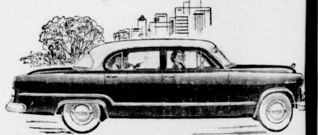
New '53 Dodge Coronet V-8 Four-Door Sedan

Compare what you get for what you pay. Discover that Dodge prices start below many models in the lowest-priced field. Size up the extra comfort, safety and style distinction Dodge offers. Step up to a solid, dependable Dodge. Step out in the smartest bargain on the road—the Mobilgas Economy Winner!