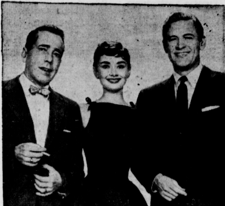
Humphrey Bogart, Audrey Hepburn and William Holden co-star in Billy Wilder's brand new Paramount comedy delight, "Sabrina," which is due to open next Sunday at the Palace Theatre. Bogie and Bill portray the roles of immensely wealthy brothers, both in love with Audrey, the chauffeur's daughter. The devious schemes to win Audrey's lovely hand makes for gay, light-hearted, frothy film entertainment.