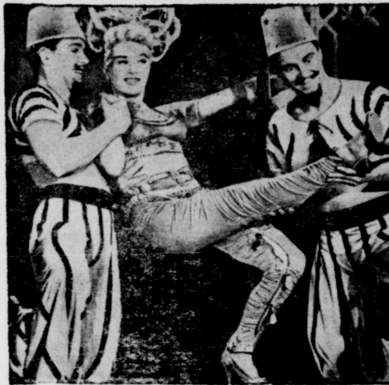
In A Love Nest For Two, three's a crowd, Betty Grable, Gower Champion, left, and Jack Lemmon find in Columbia Pictures' "THEE FOR THE SHOW," in CinemaScope and color by Technicolor at the PALACE THEATRE. Marge Champion also stars.